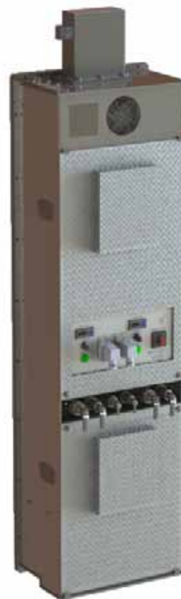
OEM Analog e-Cathode™