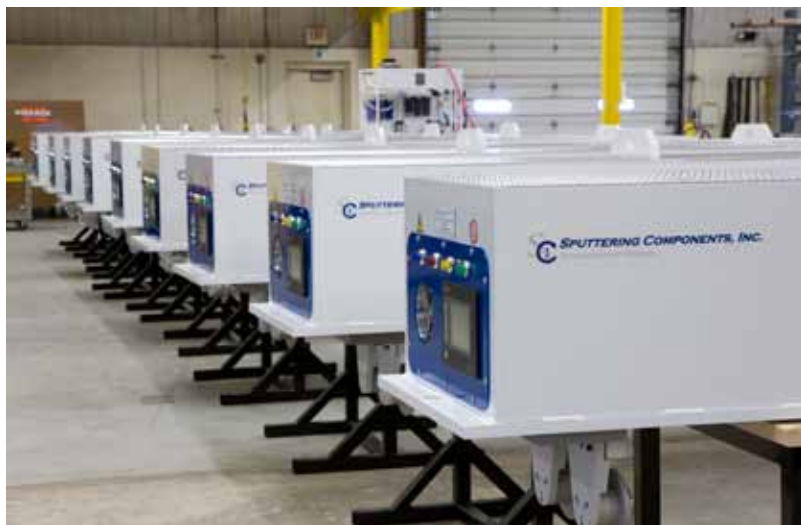
OEM Digital e-Cathode™

SCI provides OEM equipment builders complete turn-key solutions, ready to interface with their systems. SCI can customize these solutions to provide as much controls integration as desired onboard the e-Cathode™.